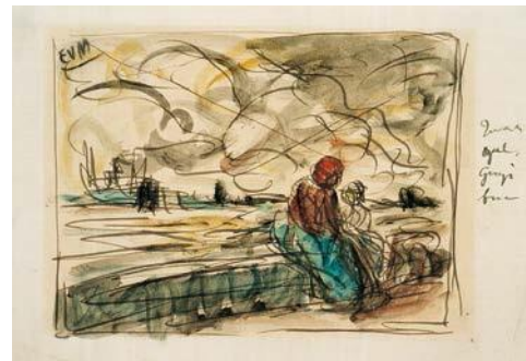
Eugene van Mieghem, Moeder met kind aan de Schelde (studie)1922

Continuing the theme of the Artist as Witness, the temporary exhibition programme 2017 will again engage contemporary appraisals of historical and social issues. The broad theme of Migrations will be taken up as its curatorial precept and in early spring we will examine both historical immigration and emigration with our Eugene Van Mieghem exhibition.